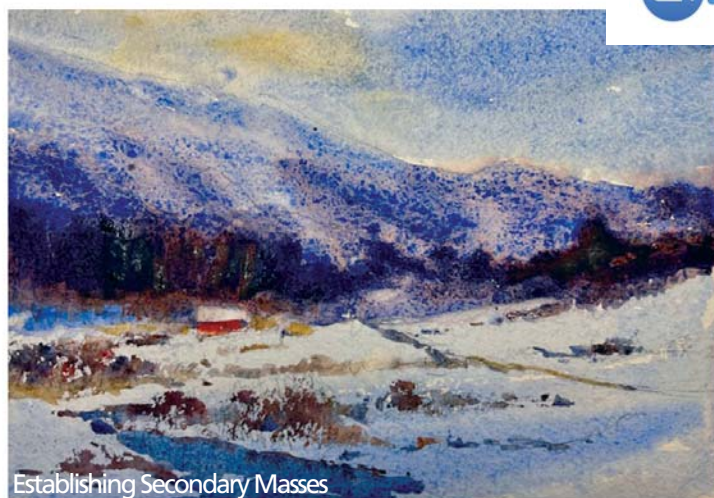
Establishing Secondary Masses