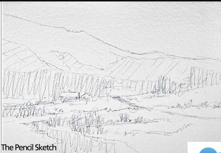
The Pencil Sketch