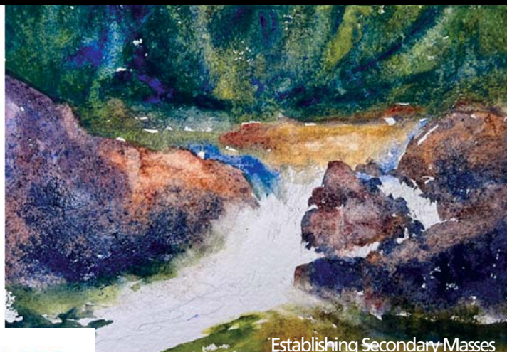
Establishing Secondary Masses