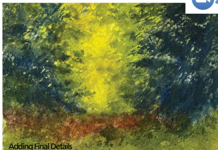
Adding Final Details