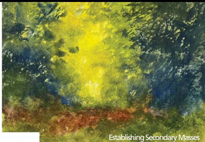
Establishing Secondary Masses