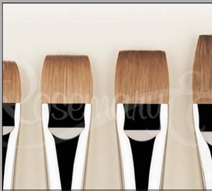
SERIES 77 PURE SABLE 'BRIGHTS'

But, if you're interested, I can suggest a couple of alternatives that might work for you. The first is the Rosemary brush, which is a little pricier, but it's definitely worth it. The second option is more budget-friendly, so it might be a better fit if you're on a tight budget.