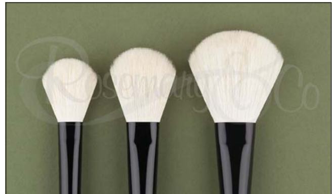
Series 107 Goat Hair Oval Mop